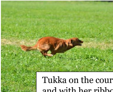
Tukka on the course and with her ribbons.