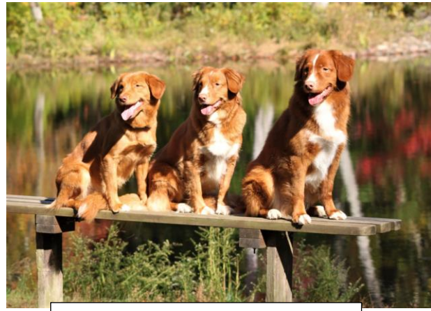
Three Redheads all in a row!

Donna and the D Tails' staff wish everyone a Happy Thanksgiving!